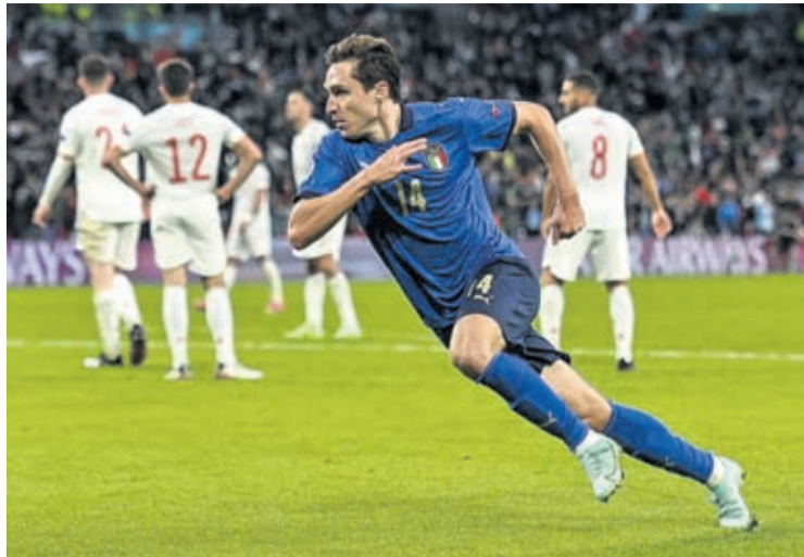
Morata missed the next-to-last kick in the shootout, giving Jorginho the chance to win it.

The match had finished 1-1 through extra time. Federico Chiesa scored for Italy with a curling shot in the 60th minute but Alvaro Morata equalized for Spain in the 80th.